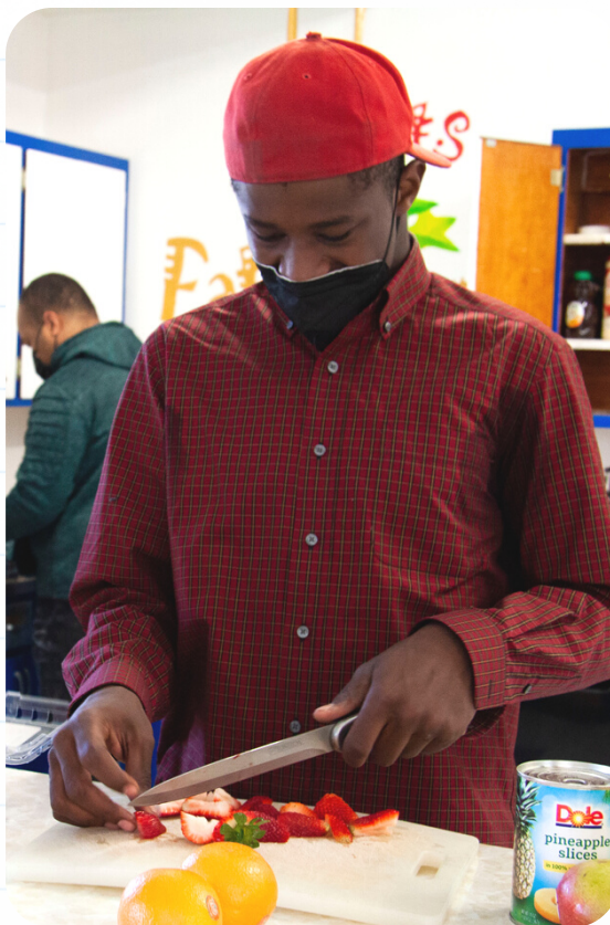
A participant prepares a fruit salad with his group during his weekly cooking class