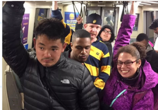
Top: A participant volunteers at an urban farm. Bottom: A group rides the BART train