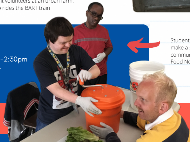
Students work together to make a salad for homeless community members for Food Not Bombs